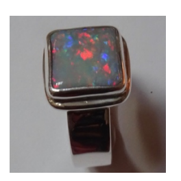
for arthritic fingers